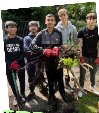
Let's Grow Preston

The feedback from ALL employers has been outstanding and they have represented the school and themselves impeccably. Well done Year 10!