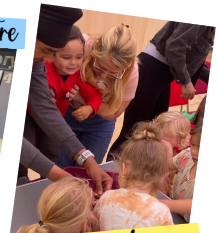
Strive 2 Thrive