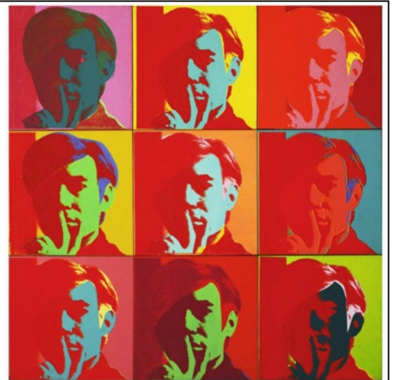
Andy Warhol, Self-Portrait, 1966. Silkscreen ink on synthetic polymer paint on nine canvases. Each canvas 22 1/2 x 22 1/2" (57.2 x 57.2 cm), overall 67 5/8 x 67 5/8" (171.7 x 171.7 cm) Gift of Philip Johnson.